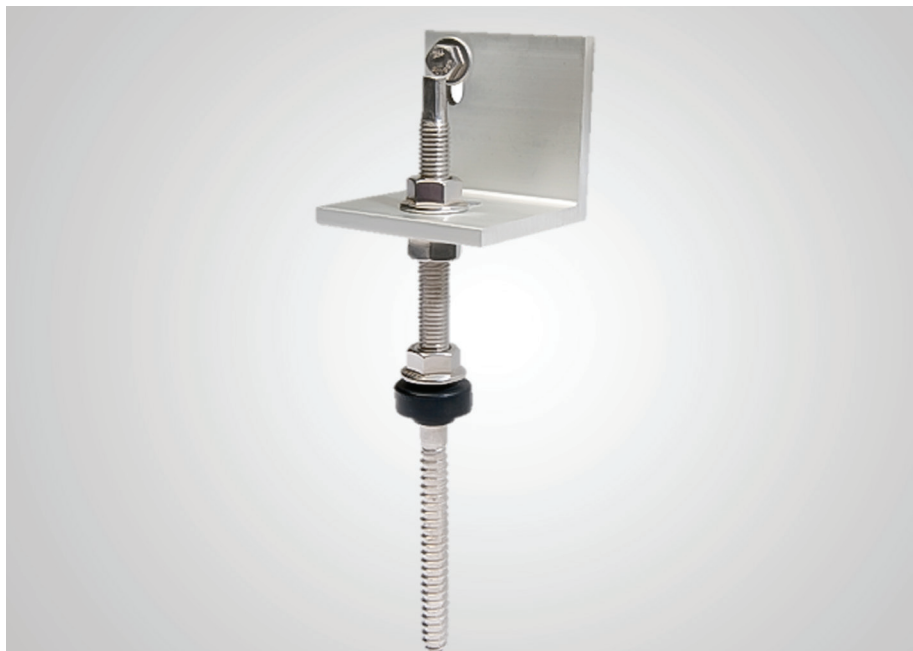
Heavy hanger bolt used for both wood and metal rafters to secure attachments to roof.

Penetrate the wood or metal rafters with our hanger bolts.