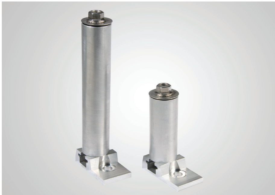
Standoff with 3.5", 5" and 8" options. Base plates are optional.

Available in 3.5", 5", and 8" to raise your modules to a higher clearance.