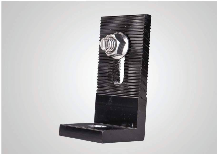
L Foot with black anodized finish

Our L-Foot is the support component for the Griprac Standard Rail. It is commonly used as part of the Griprac Flashing Kit for composition shingle roof.