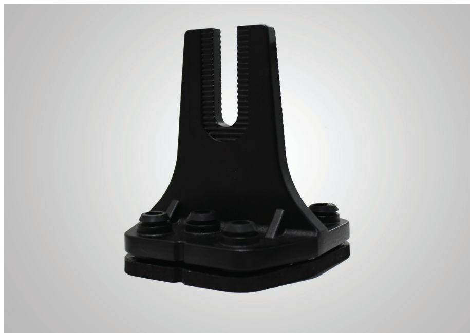
Quick Grip with full waterproof protection

Our Quick Grip respects the roof with a cast-aluminum barrier encasing an industrial-grade foam-and-mastic seal, accelerating installation and ensuring top waterproofing protection.