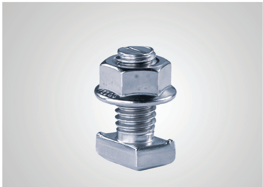
T Bolt assembly used to clamp accessories to GripRail.

Our T Bolt is a critical component of our racking system, allowing for the connection between L Feet, Ground Lugs, and Rails.