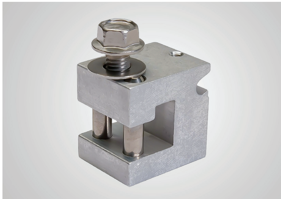
A2 Standing Seam Clamp, designed to not penetrate or damage panels

Our T Bolt (edit later) is the support component for the Gripac Standard Rail. It is commonly used as part of the Gripac Flashing Kit for composition shingle roof.